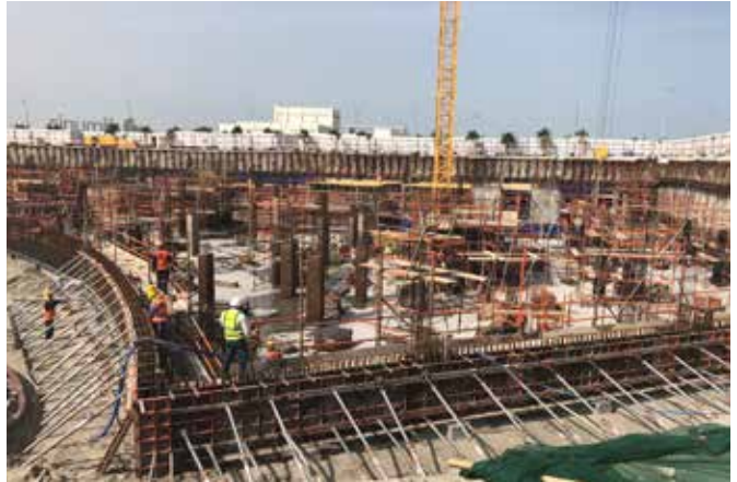
Concreting of pile caps complete