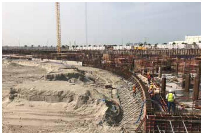
Concreting of raft slab foundation complete