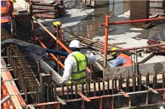
Concreting of piles complete